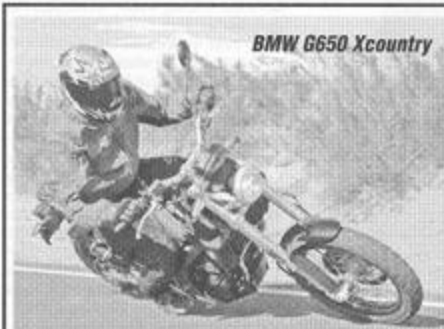
BMW G650 Xcountry